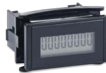
Optional LCD display (external)